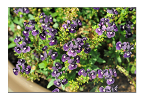
Escential Blackberry Nemesia flowers

Escential Blackberry Nemesia features dainty spikes of fragrant royal blue pea-like flowers with violet overtones and yellow eyes at the ends of the stems from late spring to late summer. Its small pointy leaves remain green in color throughout the season.