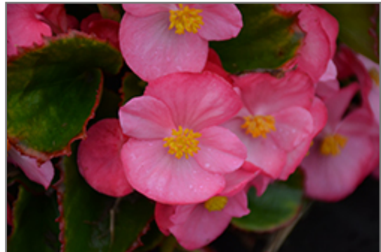
Sprint Plus Rose Begonia flowers