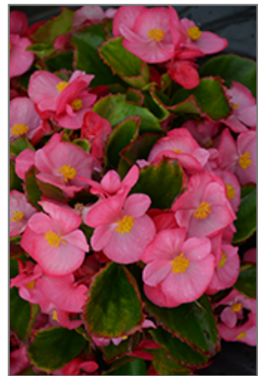
Sprint Plus Rose Begonia flowers