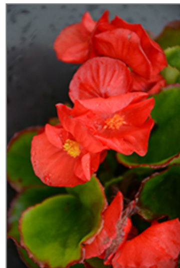
Sprint Plus Red Begonia flowers