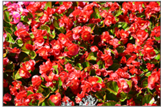
Sprint Plus Red Begonia flowers

Sprint Plus Red Begonia will grow to be about 9 inches tall at maturity, with a spread of 12 inches. Its foliage tends to remain low and dense right to the ground. This annual will normally live for one full growing season, needing replacement the following year.