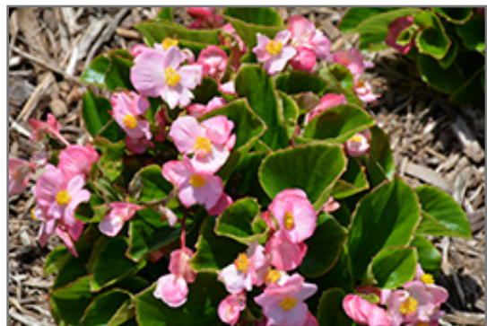
Sprint Plus Pink Begonia flowers