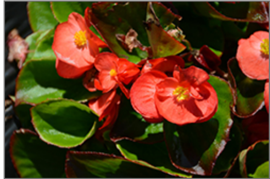
Sprint Plus Orange Begonia flowers

Sprint Plus Orange Begonia is recommended for the following landscape applications;