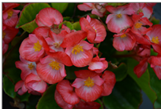
Sprint Plus Blush Begonia flowers

Sprint Plus Blush Begonia is recommended for the following landscape applications;