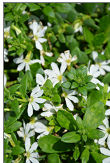
Scampi White Fan Flower flowers