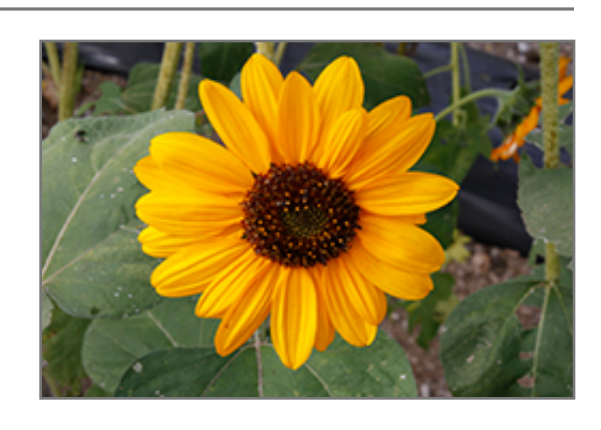
Soraya Sunflower flowers

Soraya Sunflower will grow to be about 5 feet tall at maturity, with a spread of 18 inches. When grown in masses or used as a bedding plant, individual plants should be spaced approximately 24 inches apart. This fast-growing annual will normally live for one full growing season, needing replacement the following year.