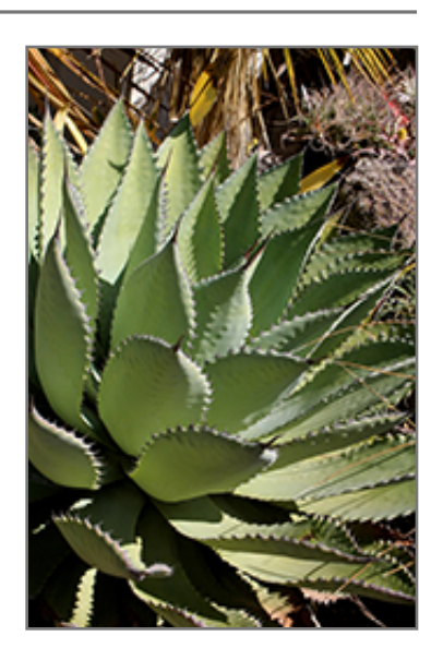
El Camaron Butterfly Agave