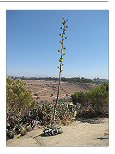
El Camaron Butterfly Agave in bloom

339 South Great R Lincoln, MA, 01773 phone: 781-259-8884 lynne@stonegategardens.com www.stonegategardens.com