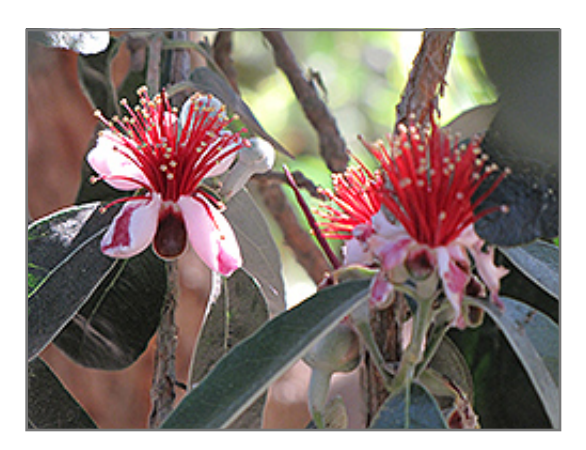
Nazemetz Pineapple Guava flowers