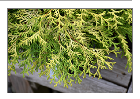
Kamarachiba Falsecypress foliage

Kamarachiba Falsecypress will grow to be about 24 inches tall at maturity, with a spread of 4 feet. It tends to fill out right to the ground and therefore doesn't necessarily require facer plants in front. It grows at a slow rate, and under ideal conditions can be expected to live for 50 years or more.