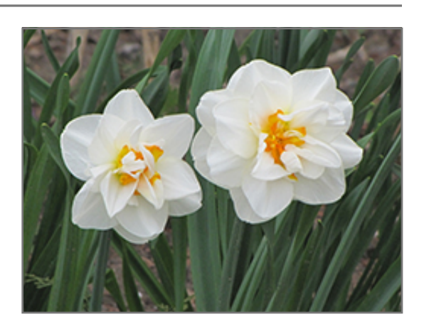
Double Poet's Daffodil flowers