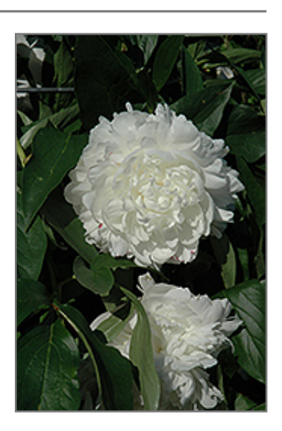
Rose Marie Lins Peony flowers

Rose Marie Lins Peony will grow to be about 30 inches tall at maturity, with a spread of 3 feet. When grown in masses or used as a bedding plant, individual plants should be spaced approximately 30 inches apart. The flower stalks can be weak and so it may require staking in exposed sites or excessively rich soils. It grows at a slow rate, and under ideal conditions can be expected to live for approximately 20 years. As an herbaceous perennial, this plant will usually die back to the crown each winter, and will regrow from the base each spring. Be careful not to disturb the crown in late winter when it may not be readily seen!