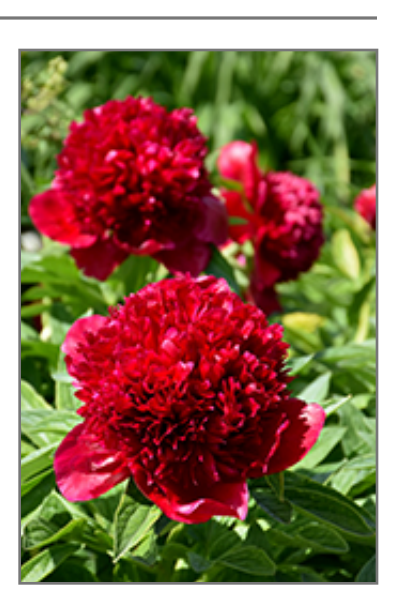
Red Charm Peony flowers

Red Charm Peony will grow to be about 30 inches tall at maturity, with a spread of 3 feet. When grown in masses or used as a bedding plant, individual plants should be spaced approximately 30 inches apart. The flower stalks can be weak and so it may require staking in exposed sites or excessively rich soils. It grows at a slow rate, and under ideal conditions can be expected to live for approximately 20 years. As an herbaceous perennial, this plant will usually die back to the crown each winter, and will regrow from the base each spring. Be careful not to disturb the crown in late winter when it may not be readily seen!