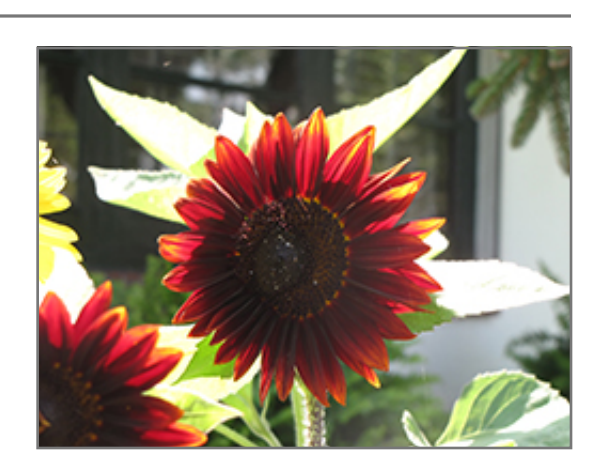
Claret Sunflower flowers

This plant is typically grown in a designated edibles garden. It should only be grown in full sunlight. It does best in average to evenly moist conditions, but will not tolerate standing water. It is not particular as to soil type or pH. It is highly tolerant of urban pollution and will even thrive in inner city environments. This is a selection of a native North American species.