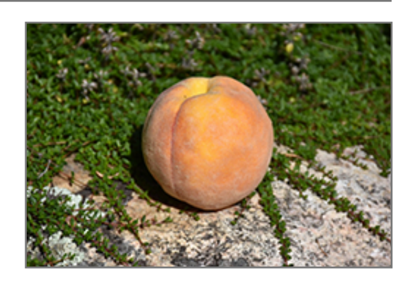
Golden Glory Peach fruit

This is a multi-stemmed deciduous shrub with a more or less rounded form. Its average texture blends into the landscape, but can be balanced by one or two finer or coarser trees or shrubs for an effective composition. This plant will require occasional maintenance and upkeep, and is best pruned in late winter once the threat of extreme cold has passed. Gardeners should be aware of the following characteristic(s) that may warrant special consideration;