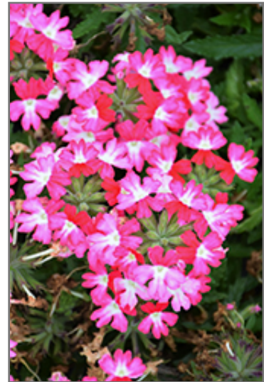
Hurricane Hot Pink Verbena flowers