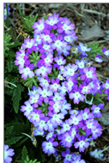
Hurricane Blue Verbena flowers