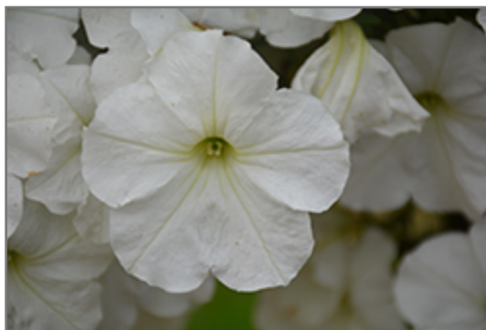
Sanguna Patio White Petunia flowers