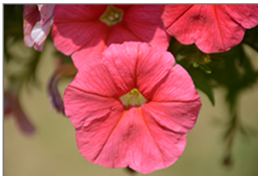
Sanguna Patio Salmon Petunia flowers