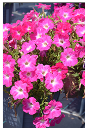
Sanguna Patio Pink Morn Petunia flowers