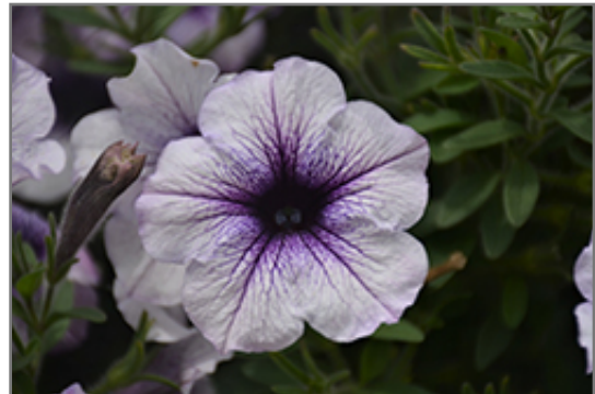
Sanguna Patio Blue Vein Petunia flowers

Sanguna Patio Blue Vein Petunia is recommended for the following landscape applications;