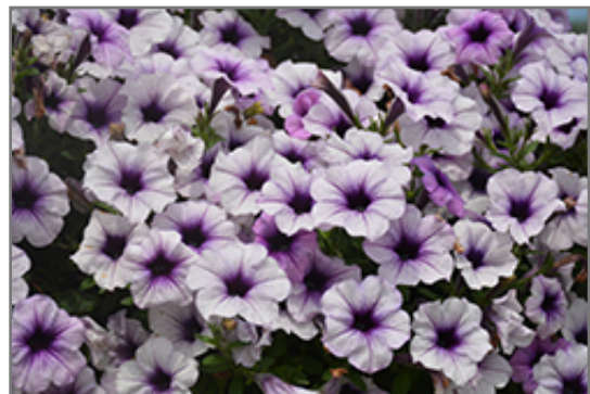
Sanguna Patio Blue Vein Petunia flowers