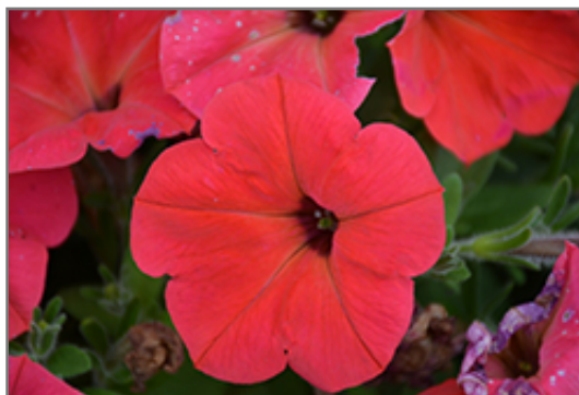
Hells Fruit Punch Petunia flowers