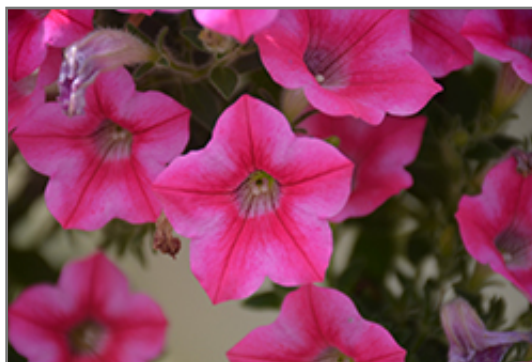
Dekko Star Rose Petunia flowers

Dekko Star Rose Petunia is recommended for the following landscape applications;