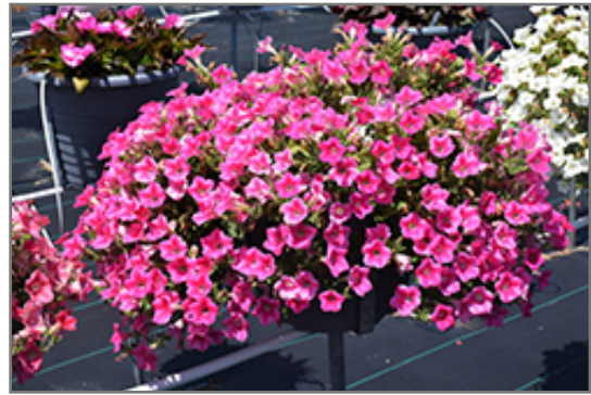
Dekko Star Rose Petunia in bloom

Dekko Star Rose Petunia will grow to be about 12 inches tall at maturity, with a spread of 22 inches. When grown in masses or used as a bedding plant, individual plants should be spaced approximately 18 inches apart. Its foliage tends to remain dense right to the ground, not requiring facer plants in front. This fast-growing annual will normally live for one full growing season, needing replacement the following year.