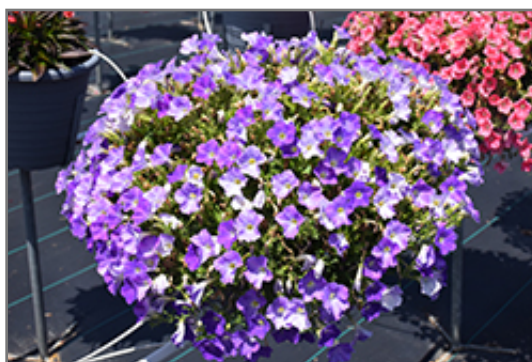
Dekko Sky Blue Petunia in bloom