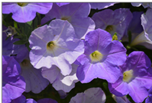
Dekko Sky Blue Petunia flowers

Dekko Sky Blue Petunia is recommended for the following landscape applications;