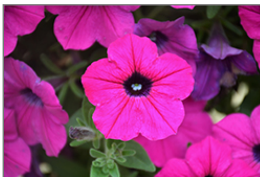
Dekko Purple Petunia flowers