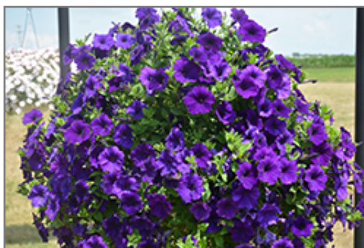
Dekko Blue Petunia in bloom