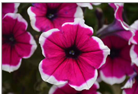
Cascadias Rim Cherry Petunia flowers

Cascadias Rim Cherry Petunia is recommended for the following landscape applications;