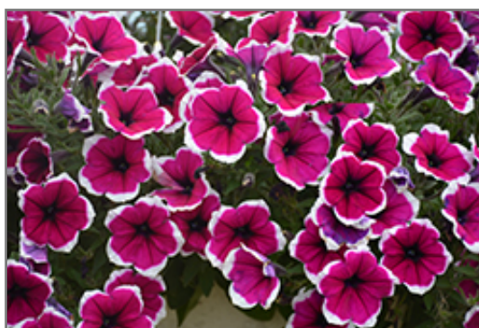
Cascadias Rim Cherry Petunia flowers