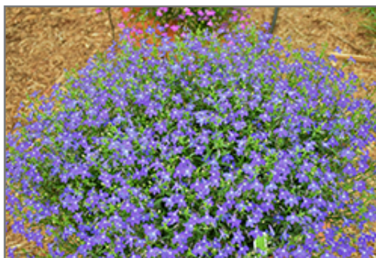
Hot Royal Blue Lobelia in bloom