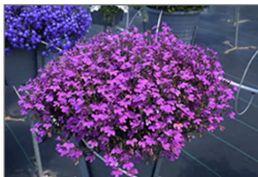
Techno Upright Purple Lobelia in bloom