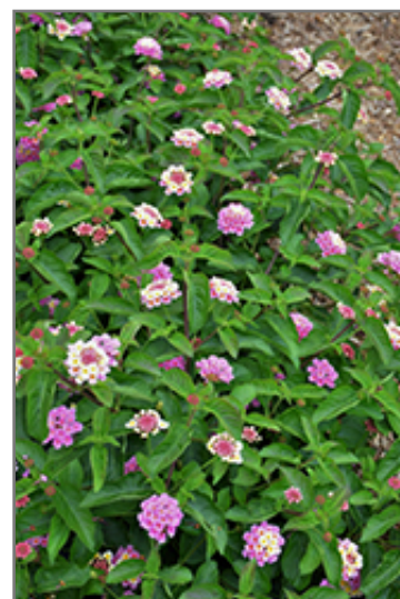
Landscape Bandana Pink Lantana in bloom