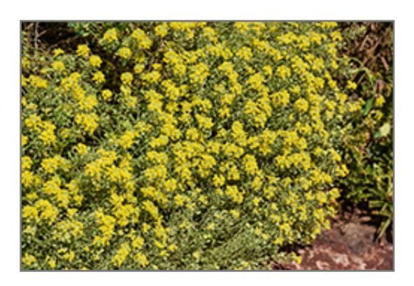
Mountain Alyssum flowers

Mountain Alyssum is recommended for the following landscape applications;