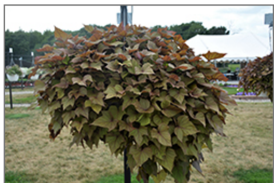
Sidekick Heart Bronze Sweet Potato Vine