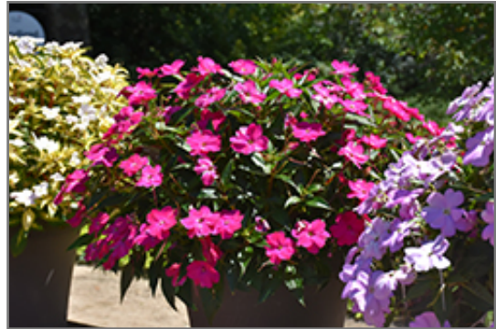
SunPatiens Vigorous Rose Pink New Guinea Impatiens in bloom

SunPatiens Vigorous Rose Pink New Guinea Impatiens will grow to be about 3 feet tall at maturity, with a spread of 3 feet. When grown in masses or used as a bedding plant, individual plants should be spaced approximately 32 inches apart. Its foliage tends to remain dense right to the ground, not requiring facer plants in front. This fast-growing annual will normally live for one full growing season, needing replacement the following year.