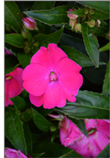
SunPatiens Vigorous Rose Pink New Guinea Impatiens flowers

SunPatiens Vigorous Rose Pink New Guinea Impatiens is recommended for the following landscape applications;