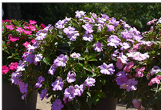
SunPatiens Vigorous Orchid Impatiens in bloom

SunPatiens Vigorous Orchid Impatiens will grow to be about 32 inches tall at maturity, with a spread of 21 inches. When grown in masses or used as a bedding plant, individual plants should be spaced approximately 18 inches apart. Its foliage tends to remain dense right to the ground, not requiring facer plants in front. This fast-growing annual will normally live for one full growing season, needing replacement the following year.