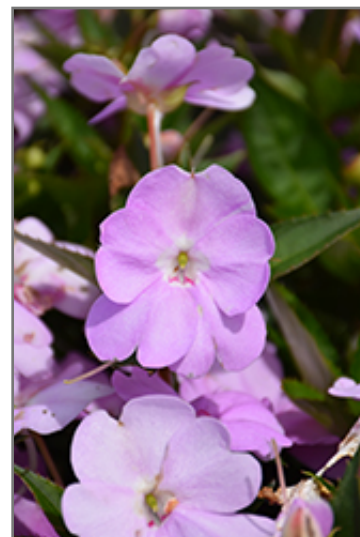
SunPatiens Vigorous Orchid Impatiens flowers

SunPatiens Vigorous Orchid Impatiens is recommended for the following landscape applications;