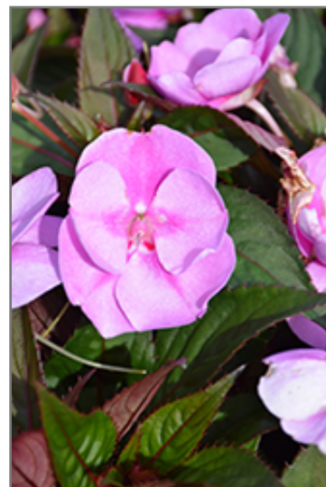
SunPatiens Vigorous Lavender Splash New Guinea Impatiens flowers