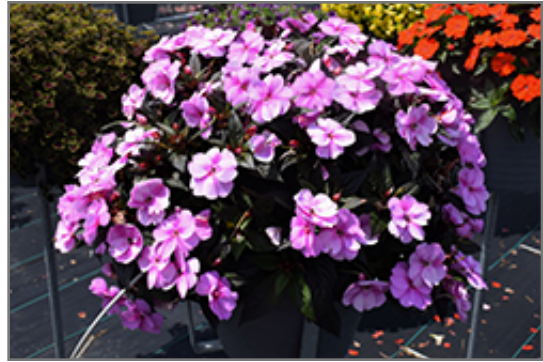
SunPatiens Vigorous Lavender Splash New Guinea Impatiens in bloom

SunPatiens Vigorous Lavender Splash New Guinea Impatiens will grow to be about 3 feet tall at maturity, with a spread of 3 feet. When grown in masses or used as a bedding plant, individual plants should be spaced approximately 32 inches apart. Its foliage tends to remain dense right to the ground, not requiring facer plants in front. This fast-growing annual will normally live for one full growing season, needing replacement the following year.