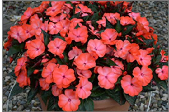
Magnum Wild Salmon New Guinea Impatiens in bloom

Magnum Wild Salmon New Guinea Impatiens will grow to be about 8 inches tall at maturity, with a spread of 14 inches. When grown in masses or used as a bedding plant, individual plants should be spaced approximately 12 inches apart. Its foliage tends to remain low and dense right to the ground. This fast-growing annual will normally live for one full growing season, needing replacement the following year.