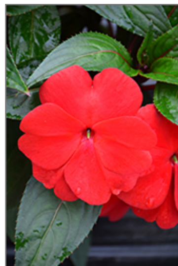
Super Sonic Dark Red New Guinea Impatiens flowers