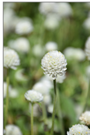
Ping Pong White Globe Amaranth flowers