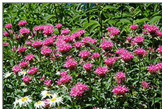
Marshall's Delight Beebalm flowers