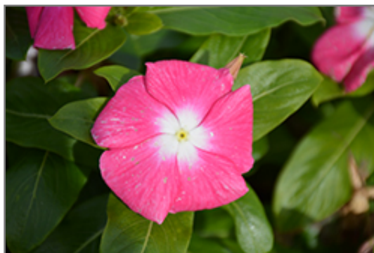
Cora XDR Pink Halo flowers