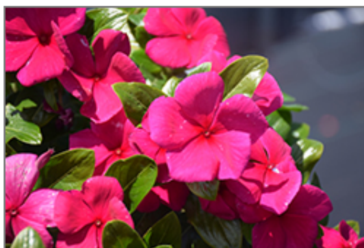
Cora XDR Hotgenta flowers

Cora XDR Hotgenta is recommended for the following landscape applications;