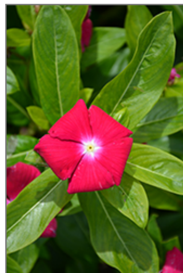
Cora XDR Cranberry flowers