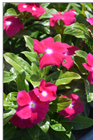
Cora XDR Cranberry flowers

Cora XDR Cranberry is recommended for the following landscape applications;