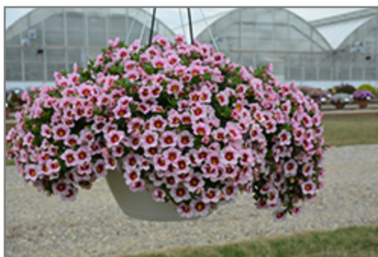
MiniFamous Uno Pink Strike Calibrachoa in bloom