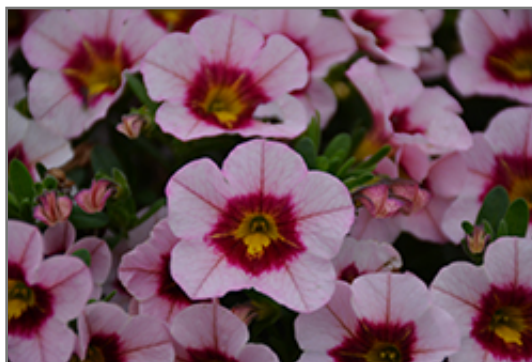
MiniFamous Uno Pink Strike Calibrachoa flowers

This plant will require occasional maintenance and upkeep. Trim off the flower heads after they fade and die to encourage more blooms late into the season. It is a good choice for attracting bees, butterflies and hummingbirds to your yard, but is not particularly attractive to deer who tend to leave it alone in favor of tastier treats. It has no significant negative characteristics.