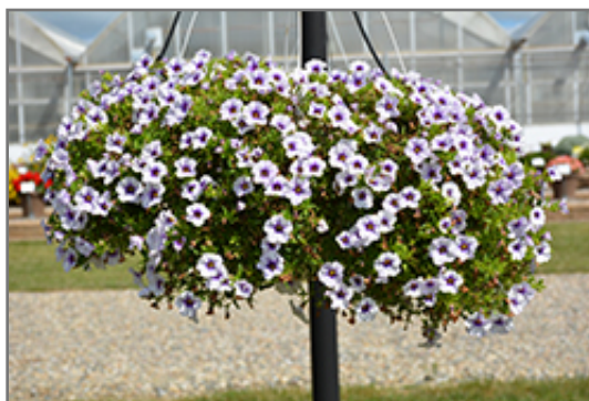
MiniFamous Neo Violet Ice Calibrachoa in bloom