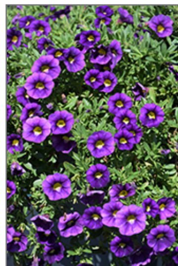
Colibri Plum Calibrachoa flowers

Colibri Plum Calibrachoa is recommended for the following landscape applications;