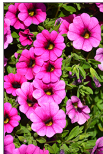
Colibri Pink Calibrachoa flowers

Colibri Pink Calibrachoa is recommended for the following landscape applications;