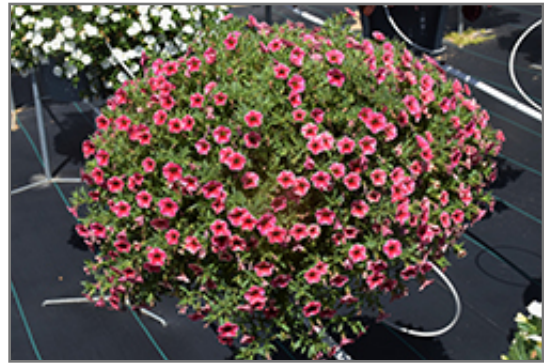
Colibri Cherry Lace Calibrachoa in bloom

Colibri Cherry Lace Calibrachoa will grow to be about 8 inches tall at maturity, with a spread of 12 inches. When grown in masses or used as a bedding plant, individual plants should be spaced approximately 10 inches apart. Its foliage tends to remain low and dense right to the ground. This fast-growing annual will normally live for one full growing season, needing replacement the following year.