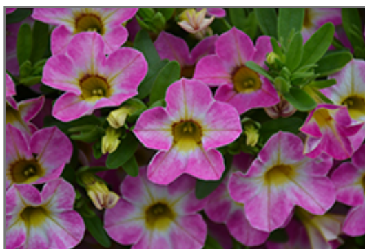
Chameleon Starlet Pink Calibrachoa flowers

This plant will require occasional maintenance and upkeep. Trim off the flower heads after they fade and die to encourage more blooms late into the season. It is a good choice for attracting bees and hummingbirds to your yard, but is not particularly attractive to deer who tend to leave it alone in favor of tastier treats. It has no significant negative characteristics.