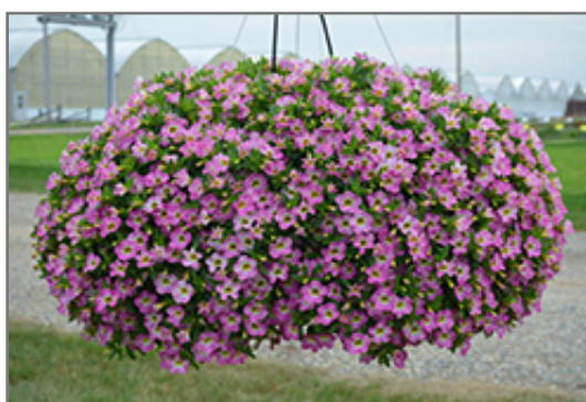
Chameleon Starlet Pink Calibrachoa in bloom