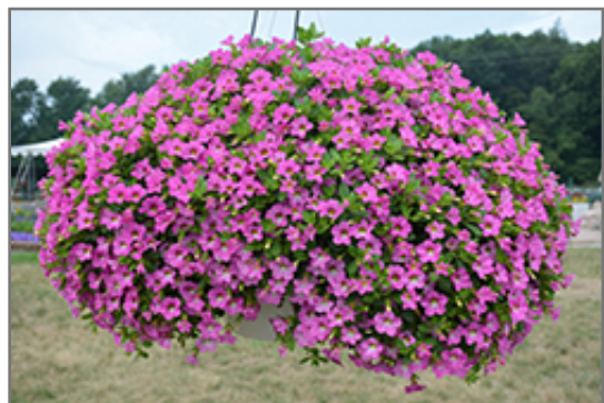
Chameleon Pink Diamond Calibrachoa in bloom